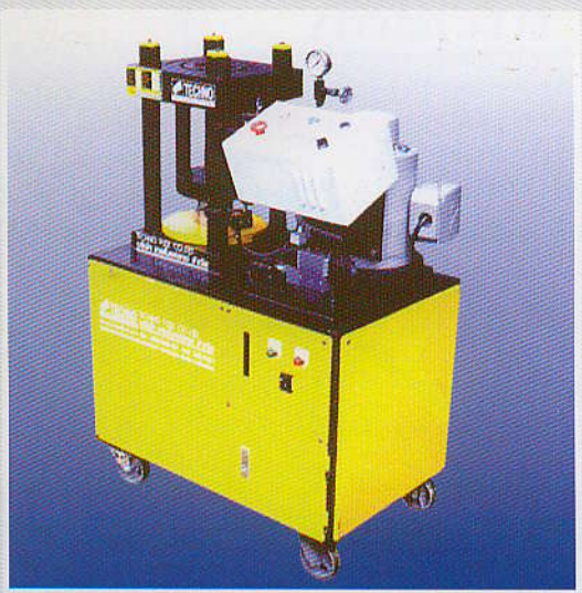
TF-50 AMS CRIMP TRAPPER®