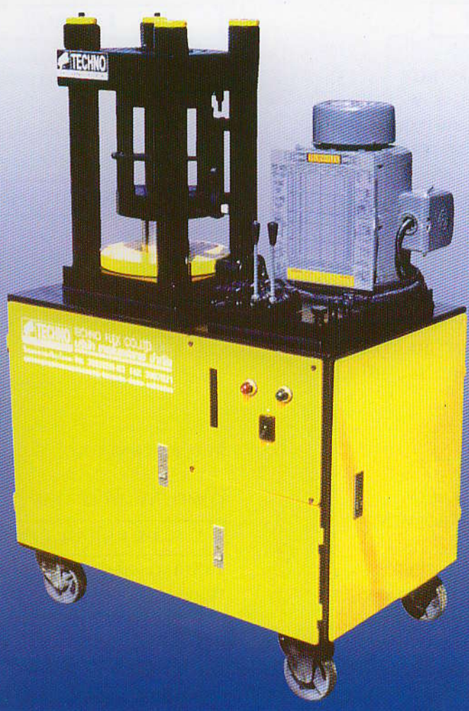
TF-50 MS TECHNO POWER®